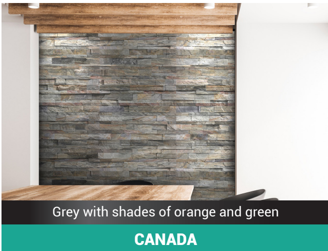
Grey with shades of orange and green